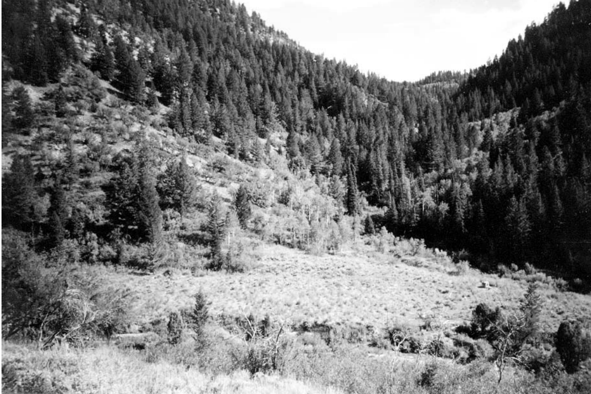
Temple sawmill acreage, 2003