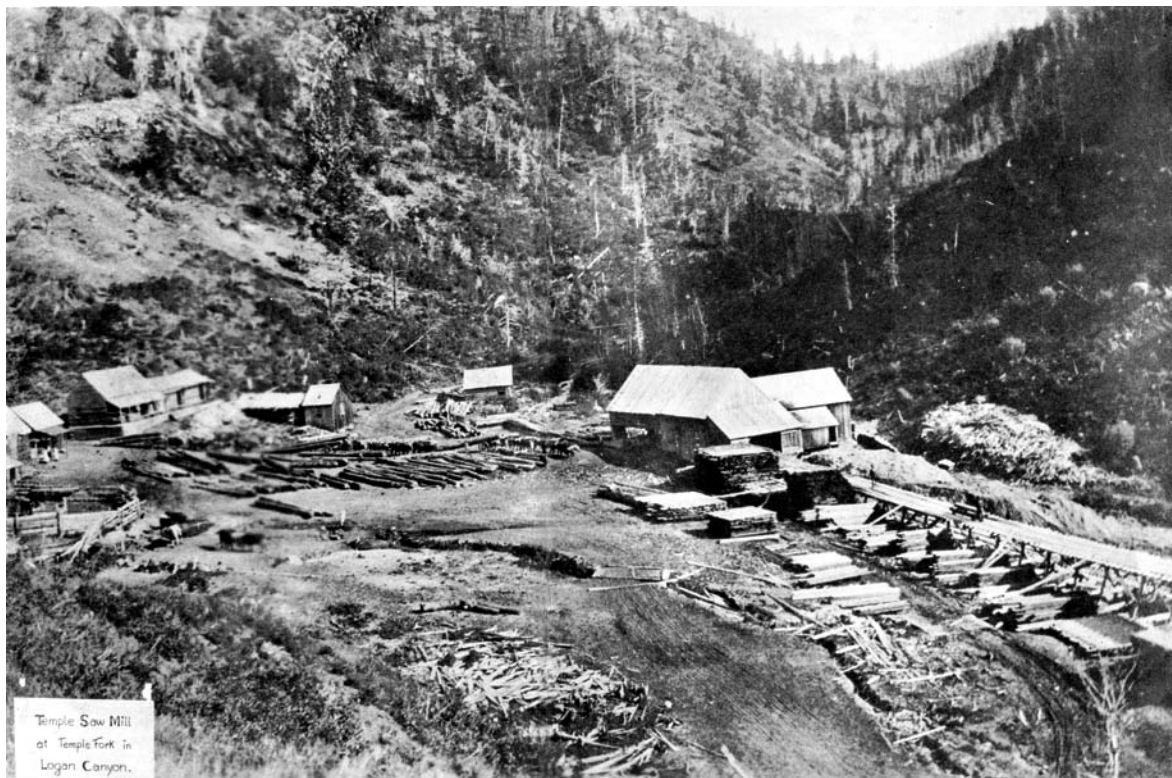
Temple sawmill activity during construction, Temple Fork, 1880

a little dance. 62 Consequently they were full of meryment & felt well. Found the work progressing favorably.