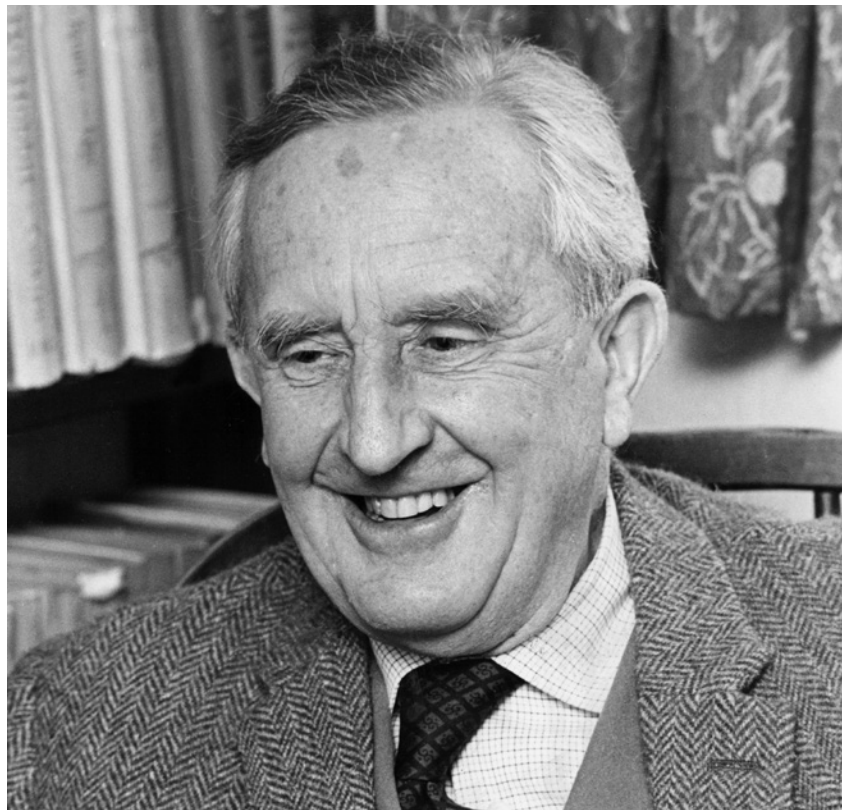
J. R. R. Tolkien.

But that is not what our friends Lewis and Tolkien believed. Especially in the figure of Aslan, Lewis described a loving but stern God who came to save us from our sins and not in our sins. As we raised our own children, my wife often told them, "Aslan is 'not a tame lion,'" 13 as a way to explain that we must come to eternal life on His terms, not our own. We must accept God's will for our lives even when we don't fully understand it. Listen to this interchange in The Silver Chair , one of the books in The Chronicles of Narnia :