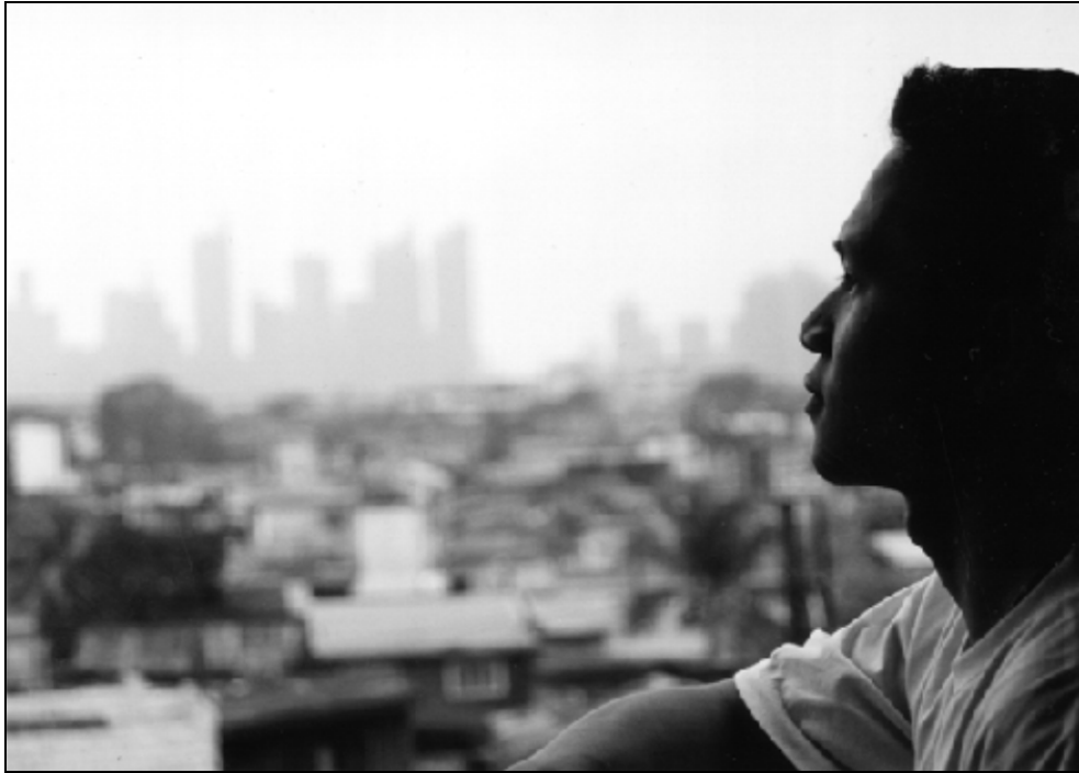
A returned missionary gaining assistance from the Perpetual Education Fund gazes at his hometown of Manila, Philippines.