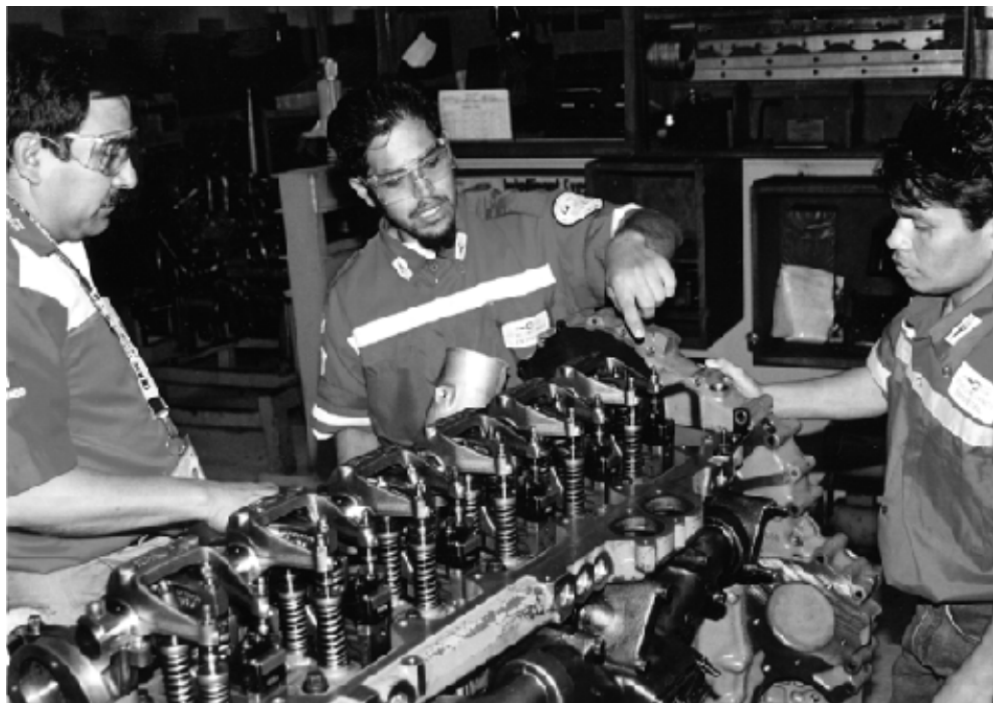
Workers at a successful diesel mechanic school in Mexico City, Mexico

The Perpetual Education Fund Board of Directors has approved the program designed by the new Church department. The plan of action has been created. The expenses of the department will be minimal because the only paid employee is its secretary. The budget for travel and other expenses will be paid, not out of the fund but by the Church budget. The department is establishing the program on a small basis, as President Hinckley counseled, and by the end of the year, loans for worthy and needy recipients will be available in all the less-advantaged countries of the world where we have institutes of religion and a number of returned missionaries. The scope of the plan is enormous, limited only by the size and income of the fund. The fund is rapidly growing through the generosity of the Saints. This program greatly enhances the future of disadvantaged returned missionaries and other young adults.