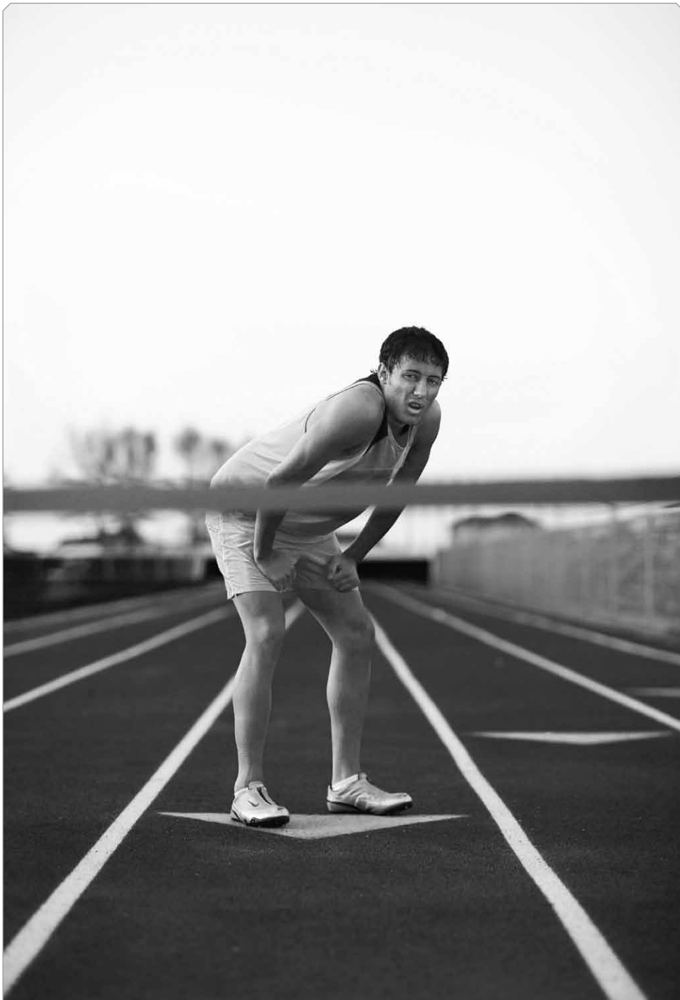
Matt Reier, © Intellectual Reserve, Inc.

The divine trio of Christ's merits, mercy, and grace enables humankind to condition and train for eternal life and endure to the end.