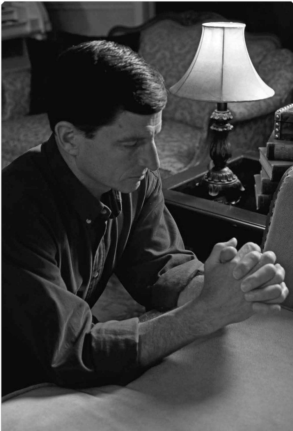
Prayer offers a way to receive divine strength and revelation and win victories over sin.