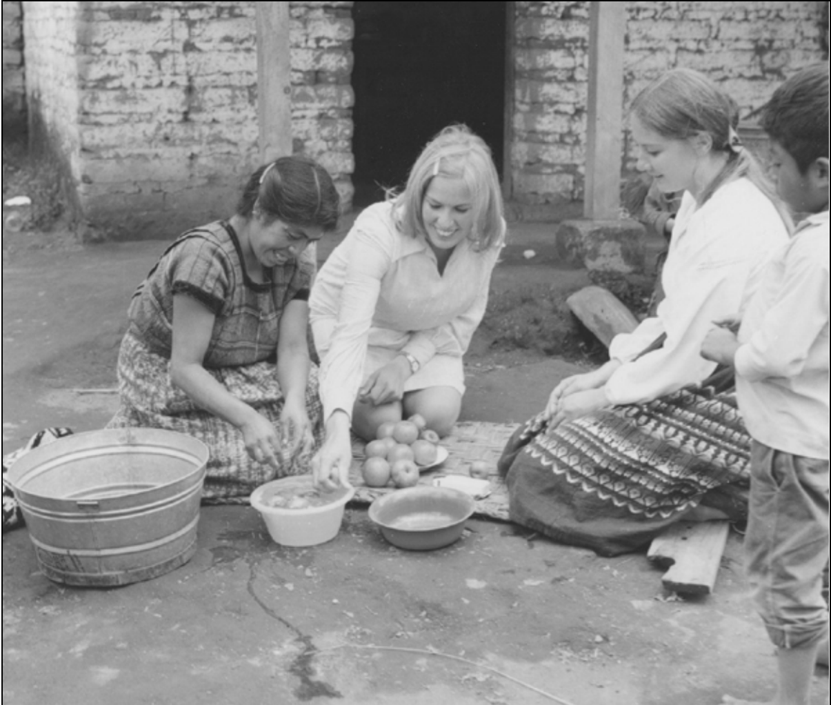
Health missionaries serving in Guatemala, ca. 1972

Photograph of health missionaries © by Intellectual Reserve, Inc. Used by permission. Peck's definition may offer a clue as to why mankind so often fails to be obedient to the great commandment: a large part of the failure may be owing to inattention and laziness—that is, we may be too weak-willed to extend ourselves sufficiently to nurture each other. In this same context, Peck suggests that laziness probably plays an important role in society's proclivity for stumbling into sin and evil (wickedness). He elaborates further on this theme: