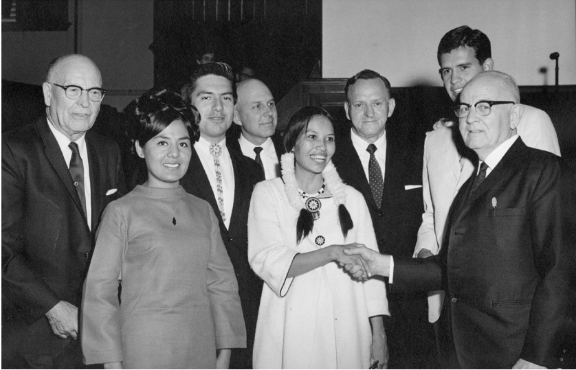
Elder Kimball at an Indian Placement meeting.

Kimball began to convert his notes and scriptures into an “extensive treatise on repentance.” After eight years of work, the manuscript was published as The Miracle of Forgiveness . 8 This book is still one of the most-used references on repentance.