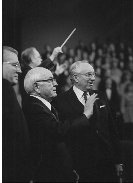
President Kimball waves to the Saints during general conference.

affable wit, kindness, bold determination, and enduring work ethic. President Kimball personally emulated his own challenge of lengthening one's stride and quickening one's pace. He was more than a man of vision; he was a man of hard work and action. He felt that "as important as it is to have this vision in mind, defining and describing Zion will not bring it about." He then clarified: "That can only be done through consistent and concerted daily effort by every single member of the Church. No matter what the cost in toil or sacrifice, we must 'do it.' That is one of my favorite phrases: 'Do It.'" 32 It is no wonder that the Church rallied behind President Spencer W. Kimball, a man who emulated his own teachings in doing whatever the Lord asked. RE