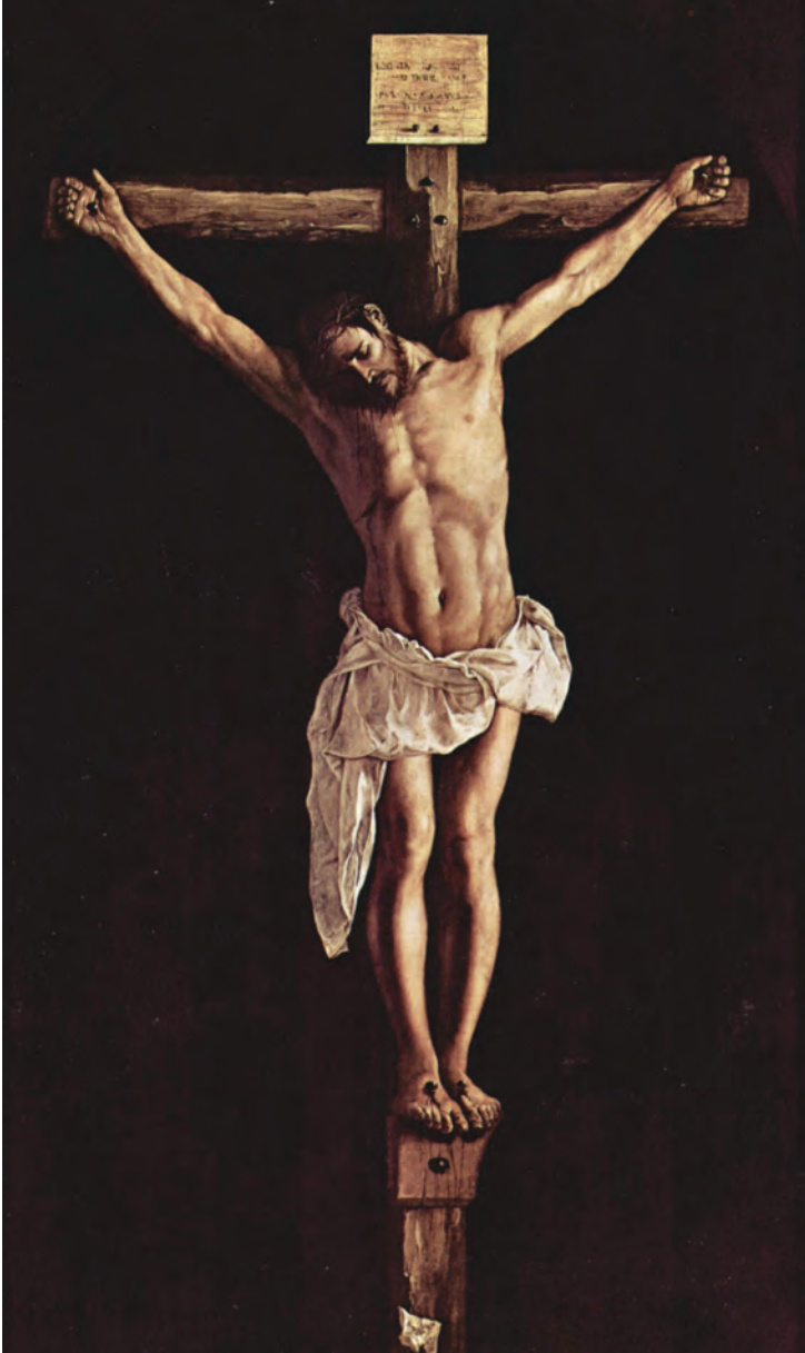
Francisco de Zurbarán, Crucifixion.