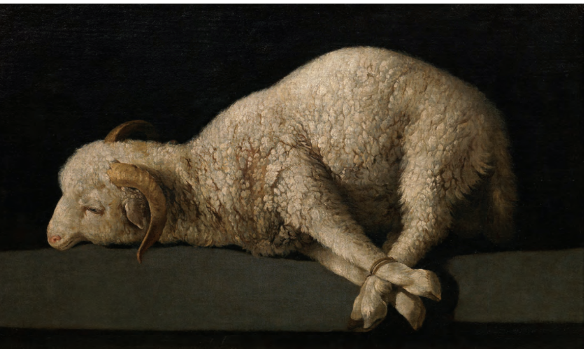
Francisco de Zurbarán, "Agnus Dei."

the Holy Sepulchre under the Greek and Latin altars of Calvary lies the Chapel of Adam, with a pane of glass revealing the rock of Golgotha. Thus, when Jesus later died upon the cross, the blood and water from his side ran down its post and flowed into Adam's grave, making him the first beneficiary of Christ's saving blood and life-giving stream. While this is but a legend, it speaks to the truth that "for as in Adam all die, even so in Christ shall all be made alive" (1 Corinthians 15:22). This also gave rise to the image of the Verdant Cross, a cross that sprouted leaves and fruit. In other words, the dead tree of cursing had become a new tree of life.