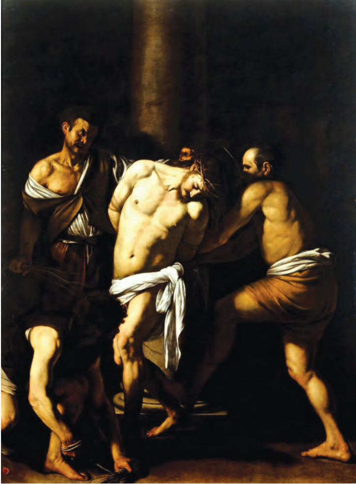
Caravaggio, The Flagellation of Christ.

The “lifting up” motif of the Gospel according to John suggests that the importance of the cross is not its shape—which could have been a t-shaped tau , an x-shaped chi , something akin to the usually depicted Latin cross, or mere scaffolding or a convenient tree—not its later use in iconography.