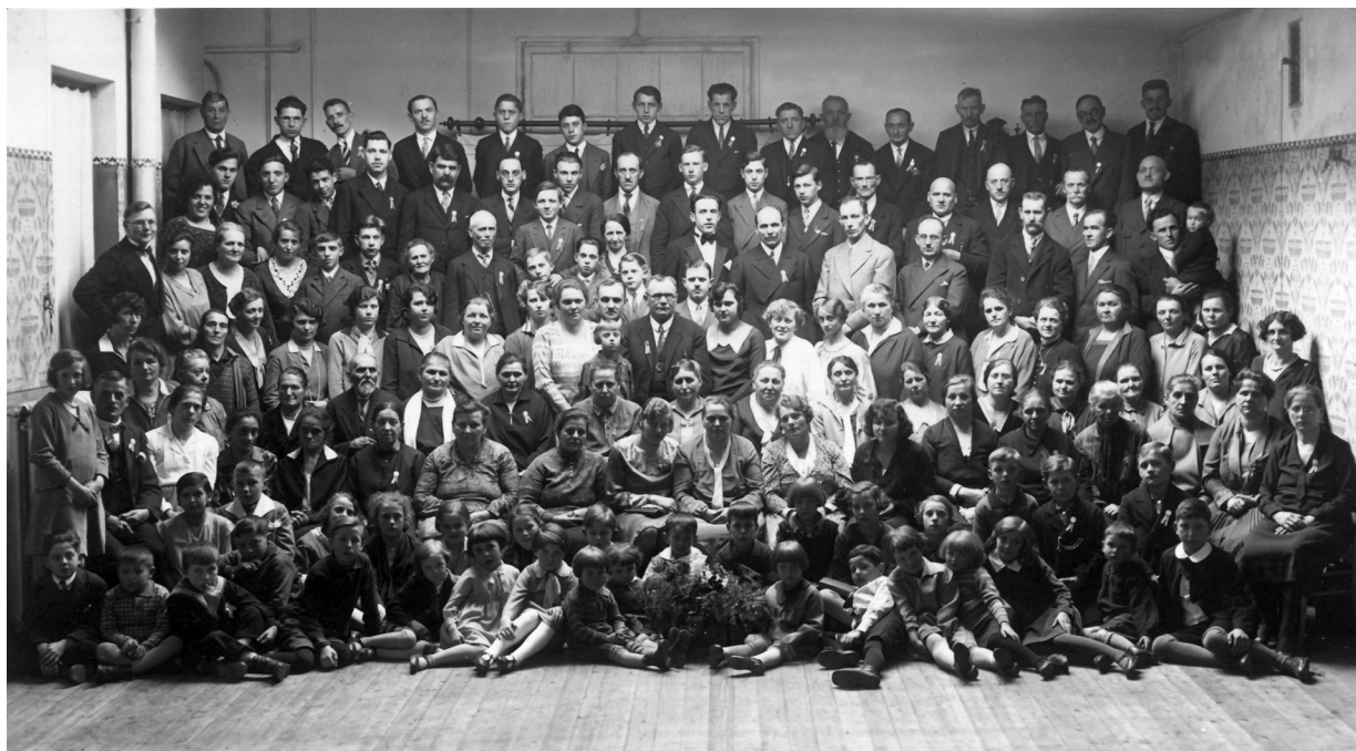
Fig. 6. This Munich Branch photograph was taken at the rear of the main meeting hall.

When I was ten years old, our class was drafted into the Jungvolk. We got the uniform and participated in the activities. We saw it as part of normal schooling but we didn't necessarily like it. We had to run a lot. For me, it wasn't much fun. We marched in the parades but never did anything like camping. They did teach us about Hitler and the National Socialist ideals, but that happened in a non-compulsory manner. We made the commitment right at the beginning that we would never miss a church meeting because of a Jungvolk activity. Sunday was my church day. All other days, I would be available. I never got into trouble because of it. 12