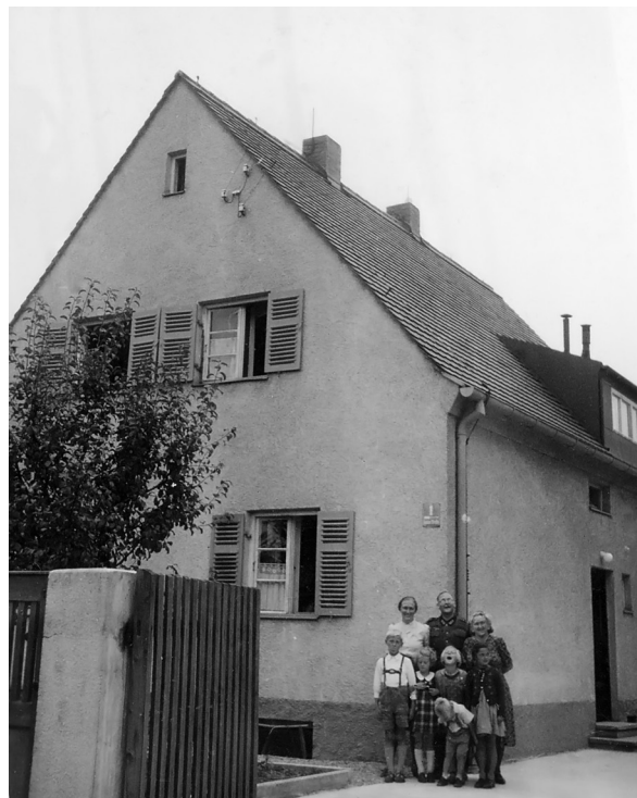
Fig. 8. The Thaller home in the Munich suburb of Solln in about 1940.