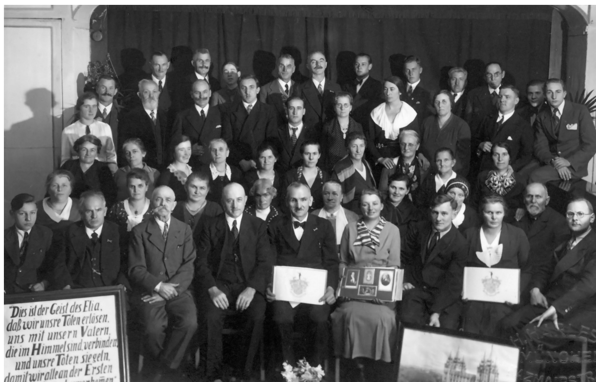
Fig. 1. Members of the Munich Branch a few years before the war. (M. Behrens)

Elisabeth recalled a sign indicating the presence of the Church in that building. She estimated the size of the congregation at sixty to seventy persons on