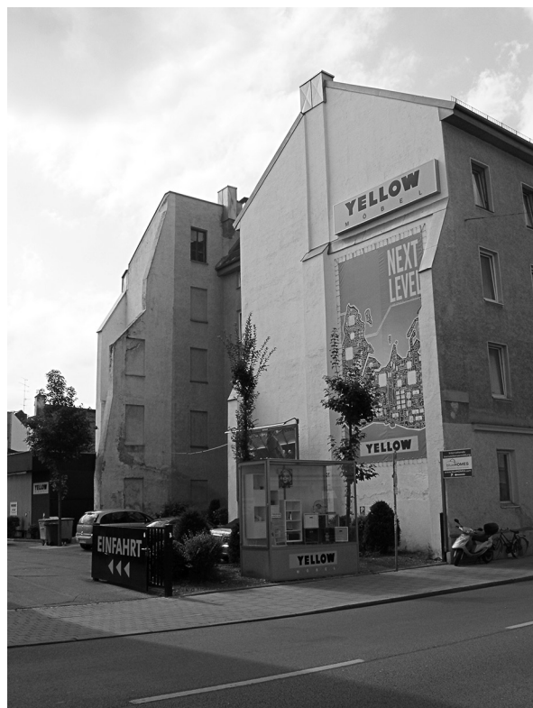
Fig. 12. The building in which the Munich Branch met during the first years of the war stood adjacent to the Hinterhaus seen at the left in this picture. No structure has been built at that location since the war.

At the end of the war, the branch members still alive and still in town gathered for meetings in rooms of the Deutsches Museum on the Museum Island in the Isar River in downtown Munich. Few members of the Munich Branch were still in the city by then. As Berta Wolperdinger explained, “When the war began, our branch was very close and we saw each other very often. But as the war continued, we felt more and more torn apart.” By the spring of 1945, many families were still living as evacuees in rural communities, and more than sixty of the members had been killed or had died of other causes.