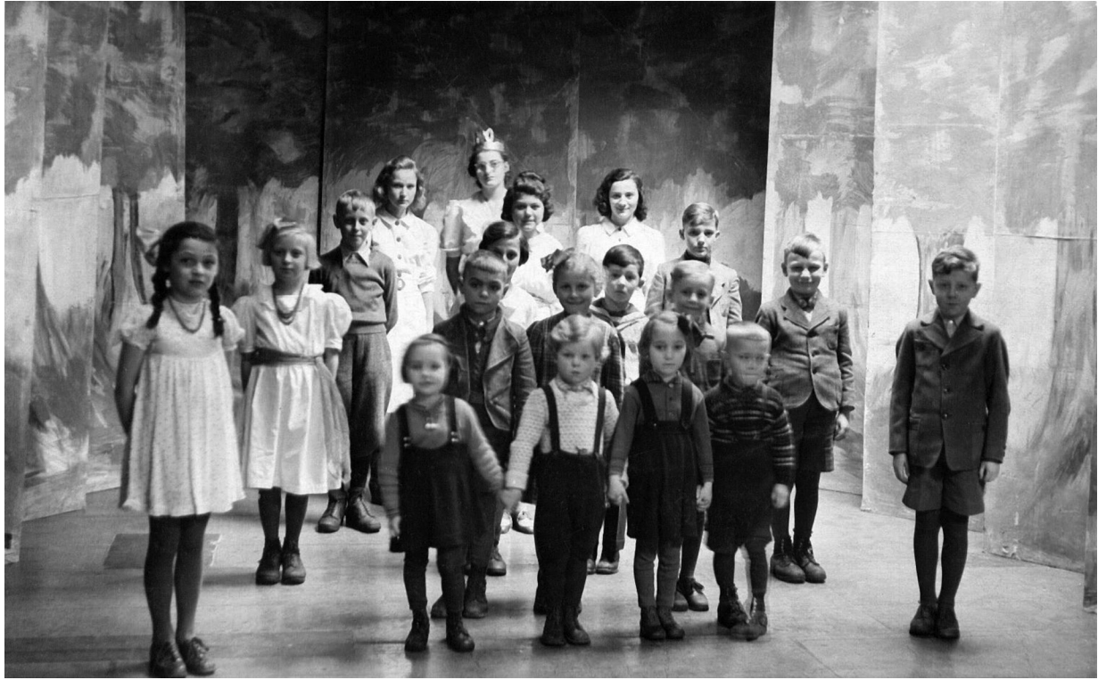
Fig. 7. The rostrum at the end of the main meeting room was used on many occasions for theatrical performances.