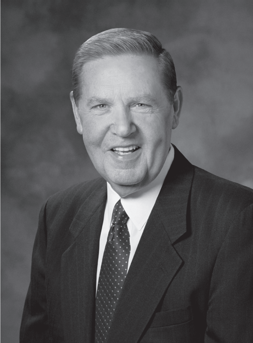
Elder Jeffrey R. Holland