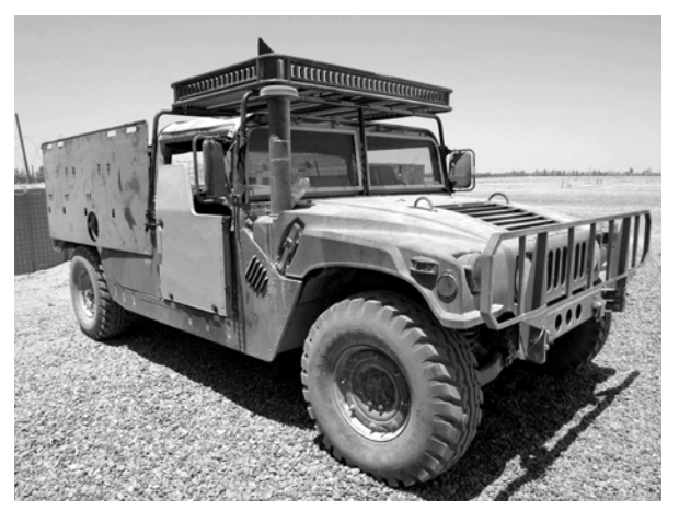
This HMMWV—pictured near Camp Fallujah, Iraq, in July 2004—has an ERC (explosive resistant coating) armored door to better protect the occupants.

A U.S. military convoy entering Forward Operating Base Q-West after completing a mission in May 2008.