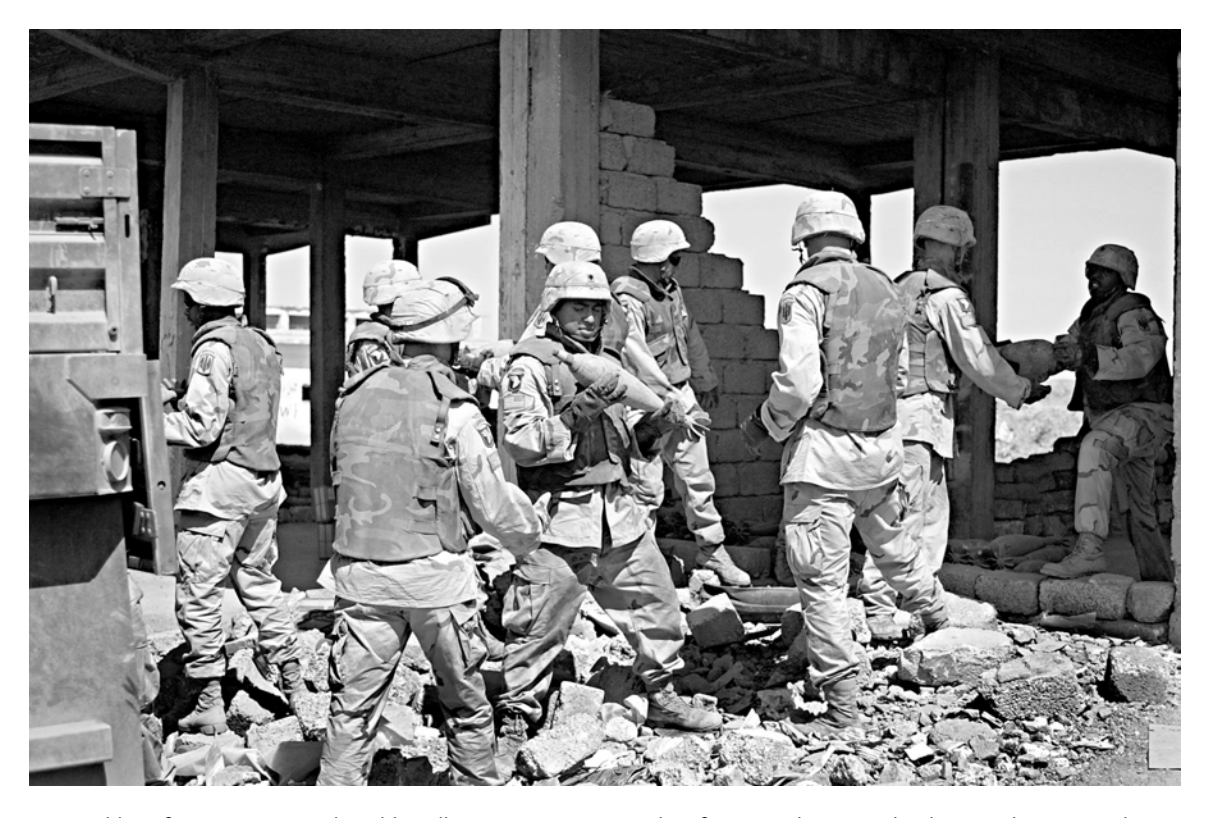
Soldiers from an Air Assault Field Artillery unit prepare a cache of Iraqi explosives to be destroyed near Mosul in July 2003.