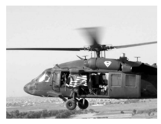
A U.S. Army helicopter is shown flying an American flag during a flight over Mosul, Iraq.