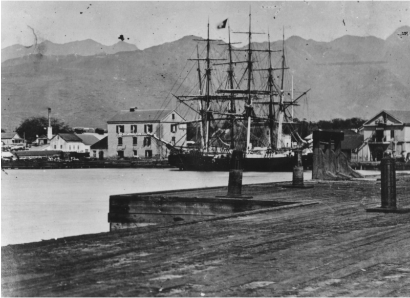
Honolulu Harbor, ca. 1850s.

the Utah elders arrived in Honolulu, nearly three thousand native Hawaiians responded to an invitation to enter the waters of baptism. 18