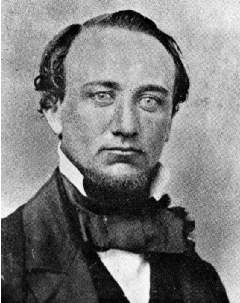
George Q. Cannon.

The following day, Cannon and his fellow companions ascended a high place near Honolulu and dedicated the land of Hawai'i for the preaching of the gospel and forthwith commenced their labors. 15 One of the ten missionaries present on the occasion recorded the following: