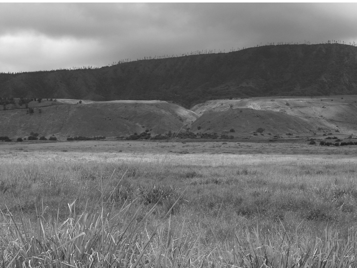
Pālāwai Basin on Lānaʻi where Mormons gathered 1854–64.

After searching for such a location, Francis Hammond described a beautiful spot on the Hawaiian island of Lānaʻi: “Lying at the foot of the large mountain on the east and extending toward a high ridge on the west, which enclosed completely a large tract of good land, perhaps 5,000 acres of which was in full view. . . . I have never seen a better tract of land in one body on these islands. I can see only one drawback to the place and this is the scarcity of water during the dry season.” 22