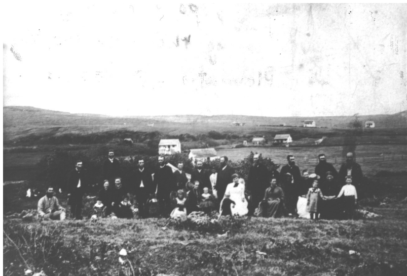
Utah missionaries at Lā'ie the LDS gathering place.

Thus, in January of 1865, Lā'ie became the official gathering place for the Hawaiian Saints and remained so for over a century. 28 But during the nineteenth and twentieth centuries, Latter-day Saints who contracted leprosy, later known as Hansen's disease, 29 were not allowed to join their