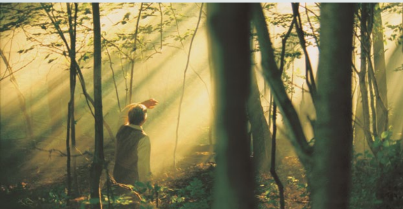
The First Vision. © 2001 Intellectual Reserve, Inc.