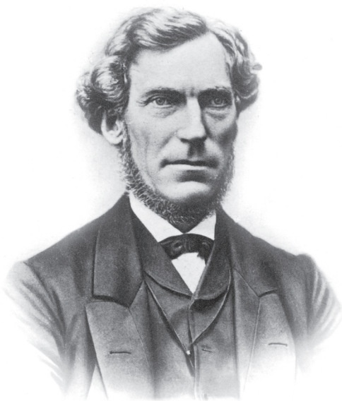
Daniel H. Wells, an early Utah pioneer, apostle, and counselor in the First Presidency of the LDS Church, served as commander of the Nauvoo Legion in Utah and as the third mayor of Salt Lake City. His son, Heber Manning Wells, became the first governor of the state of Utah.

that “so large a force is [not] necessary” and raising a small force from Utah “offer[ed] the most expeditious and economical remedy to the obstructions to the mail route.” 15