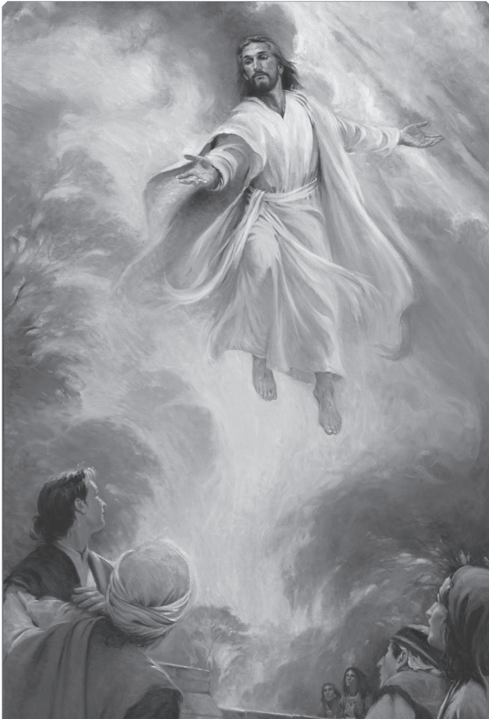
Walter Rane, They Saw a Man Descending Out of Heaven . © Intellectual Reserve, Inc.