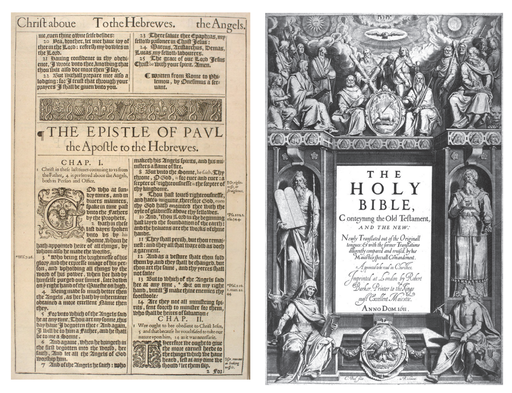
1611 King James Bible, opening of the Epistle to the Hebrews. Public domain.