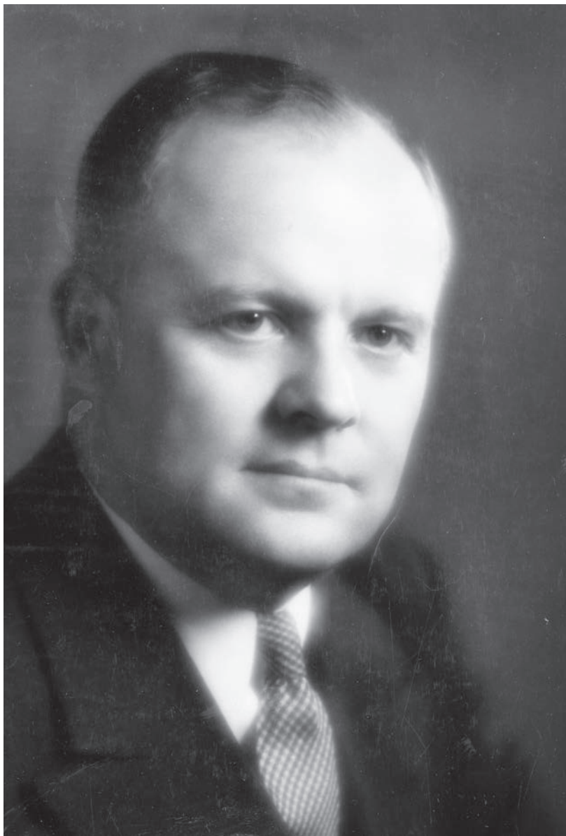
Chaplain Herbert B. Maw served as the governor of Utah from 1941 to 1949.