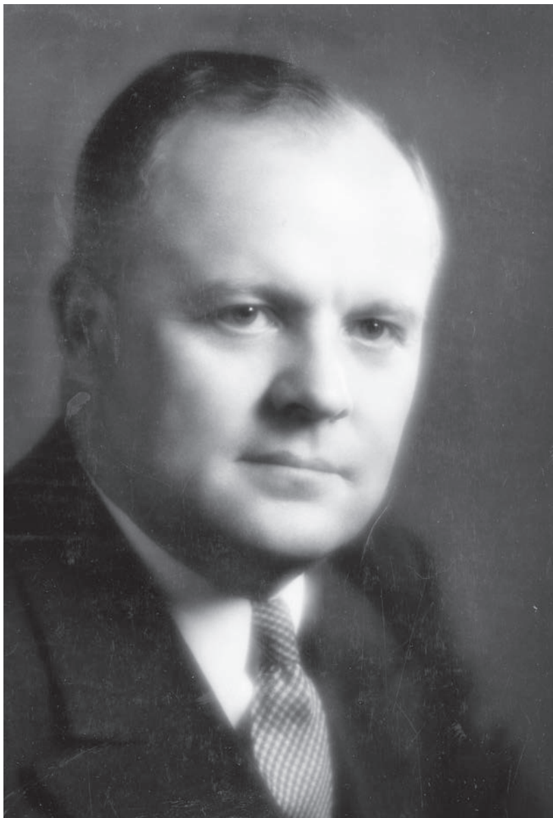
Chaplain Herbert B. Maw served as the governor of Utah from 1941 to 1949.