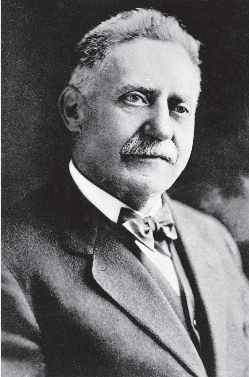
Utah's Governor Simon Bamberger appointed Elder B. H. Roberts as a chaplain.