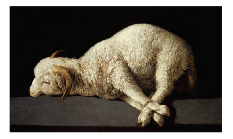
Fig. 3. Francisco de Zurbarán, The Bound Lamb , 1635–40.