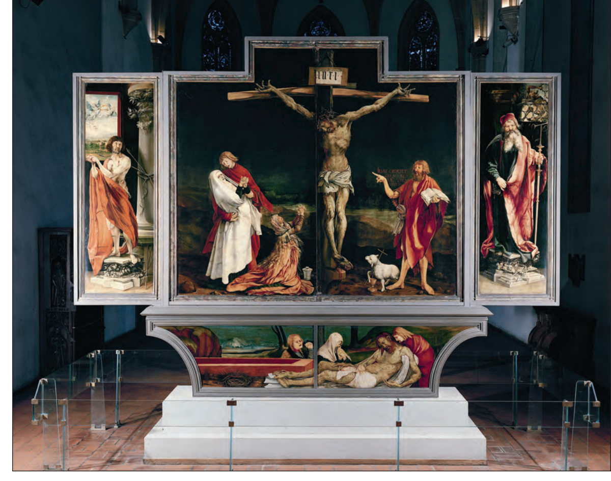
Fig. 10. Matthias Grünewald, The Isenheim Altarpiece. Musée Unterlinden, The lamb at the foot of the cross reminds us of John's image of Jesus as the Lamb of God. Here the Lamb is collecting the blood in a goblet that symbolizes the sacrament—the ordinance through which Jesus is able to pass His life to us by our partaking of His flesh and blood.

at Cana when Jesus turned the water to wine—and now at the end of His life Jesus will partake of the bitter wine just before He dies and water will flow from His breast (see John 9:34). Fourth, the rod used to put the sponge to the Savior's mouth was hyssop , the plant that was prescribed to be used in Exodus 12 to daub the blood of the lamb on the door of the houses of the faithful (see Exodus 12:22). And finally, when