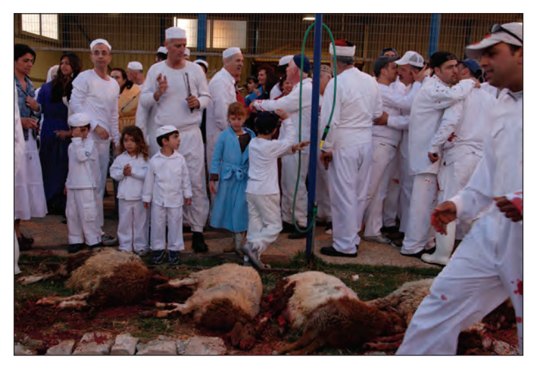
Fig. 7. Passover lambs sacrificed and Samaritan people celebrating fulfilling God's requirements.

The throat of the lamb is slit right at sunset, the exact moment determined by the Samaritan high priest. The people raise a great shout, and there is joy and clapping and hugging and kissing. The people wipe their hands in the lamb's blood and smear it on each other's foreheads from the grandparents to the young; they are exulting in the blood of the lamb which manifests their obedience to the commandments of God. They share a bond in fulfilling the requirements of God together.