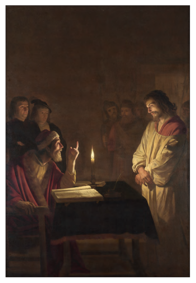
Fig. 9. Gerrit van Honthorst, Christ before the High Priest . Artistic depictions of Jesus at His trial often include the detail of the hands of Jesus bound—reminding the viewer of Isaac and of the binding of the animals for sacrifice at the temple.