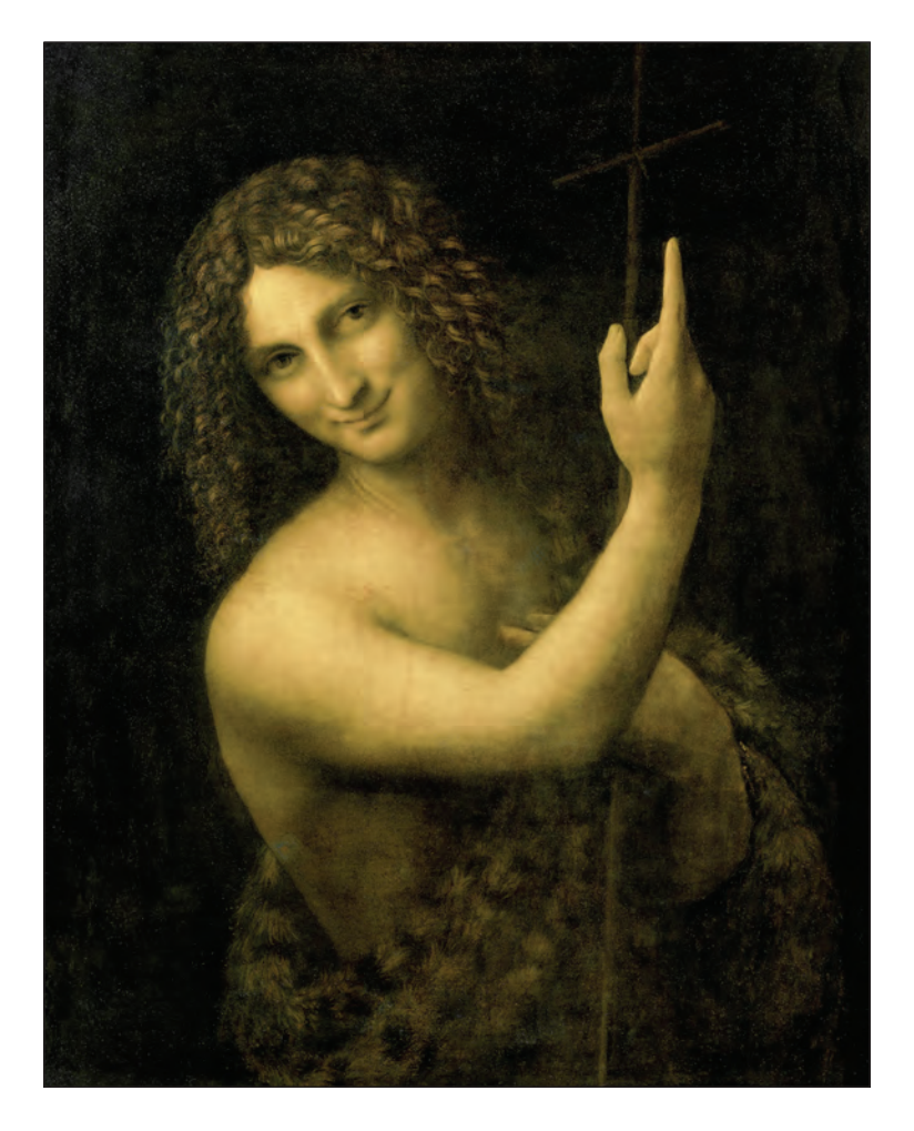
Fig. 2. Leonardo da Vinci, Saint John the Baptist , 1515. Louvre, Paris, France. "Behold the Lamb of God, which taketh away the sin of the world" (John 1:29).

the Lamb of God, yea, even the Son of the Eternal Father!" (1 Nephi 11:21).