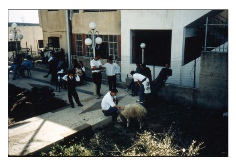
Fig. 6. Samaritan boys with lambs preparing for Passover sacrifice.

feel at home with it culturally but consider it a worshipful experience.