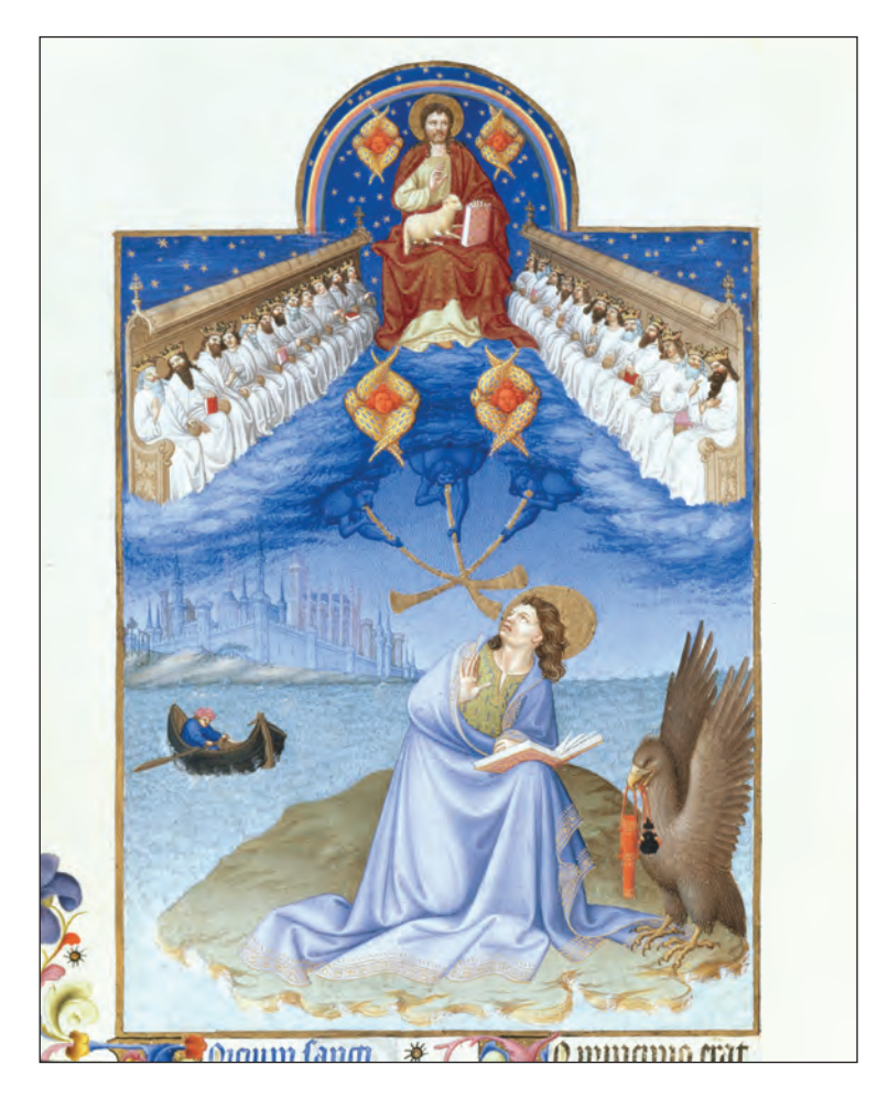
Fig. 11. Limbourg Brothers, Saint John on Patmos Contemplating the Vision of the Lamb Enthroned, the Four Beings, and the Twenty-four Elders, from Les Très Riches Heures du Duc de Berry, 1416. Manuscript on vellum, Musée Condé, Chantilly, France. Christian art often portrays John's vision of the Lamb on His throne in heaven surrounded by the twenty-four elders and the four beasts that attend His heavenly throne.