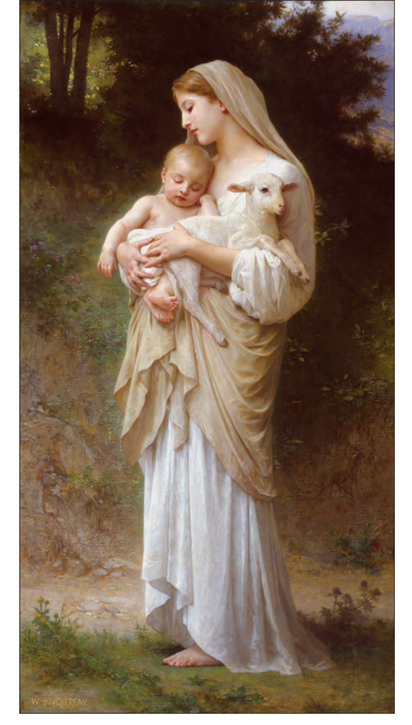
Fig. 1. William Bouguereau, L'innocence (Innocence), 1893. The lamb is portrayed to convey the idea of the innocence of the Christ child.