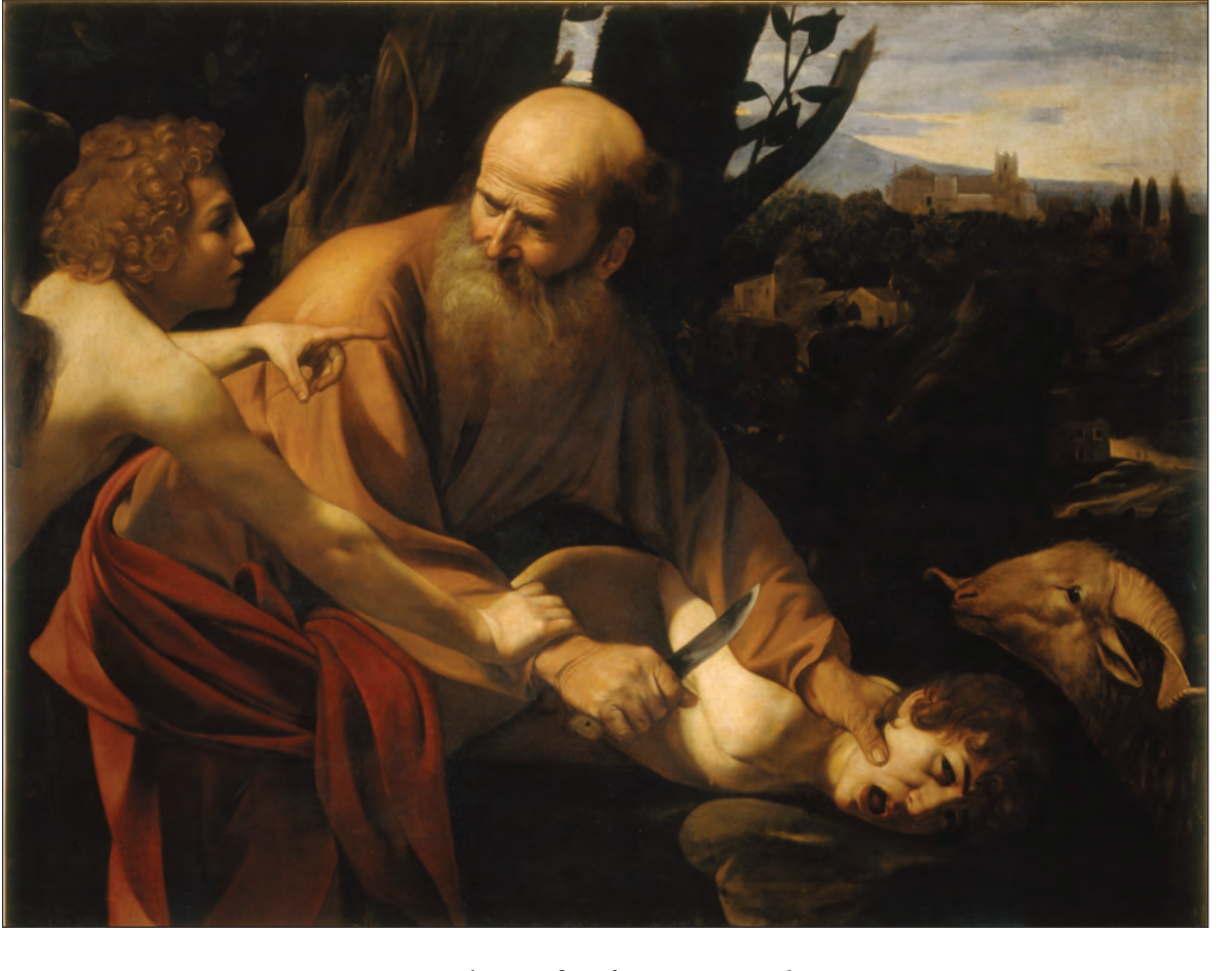
Fig. 5. Caravaggio, The Sacrifice of Isaac , 1603. In this scene our eyes move from one figure to the next trying to grasp the meaning of the sacrifice about to take place. We are struck by the horror on Isaac's face with the knife just inches from his neck. Next we look at Abraham, who is portrayed as perfectly silent. The angel directs our attention to the ram that is prepared and almost seems to be offering a protective covering for Isaac. The animal will be offered as a substitution, a sacrifice given in place of Isaac.

Abel demonstrates the necessity of the proper motivation in making an offering as Abel's firstlings were received and Cain's offering commanded by Satan was not accepted (see Moses 5:18–21). Abraham brought offerings of all he had unto Melchizedek and was blessed by him: "And he lifted up