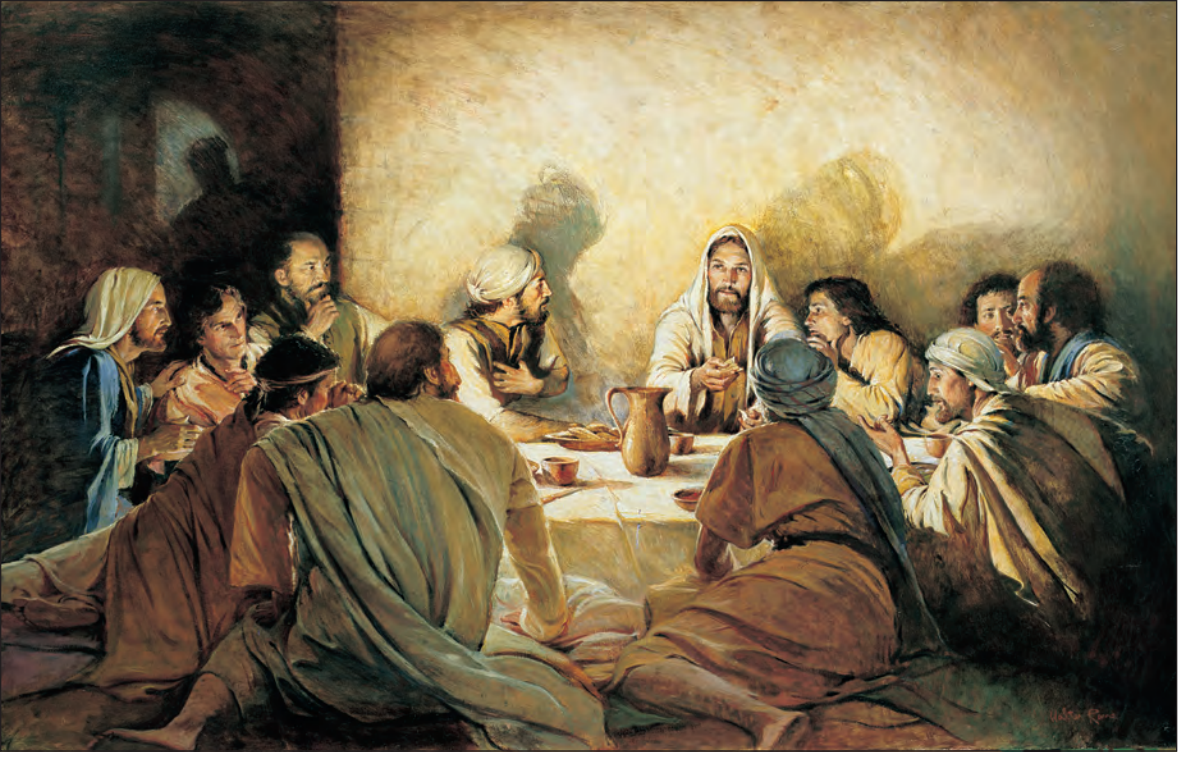
Fig. 8. Walter Rane, In Remembrance of Me . Jesus and the Apostles ate the Last Supper together according to the custom of their time reclining around a table.

altar—reminiscent of Moses, who sprinkled the blood on the altar and the people at Sinai when they made the covenant with the Lord (see Exodus 24:6). They then took the prepared lamb to the upper room, where it was roasted whole without breaking a bone (see Exodus 12:46). At sundown Jesus and His Apostles reclined around the table and, while reciting the story of the miraculous deliverance of the first Passover, ate the Passover meal consisting of the lamb, unleavened bread, the bitter herbs, and cups of wine—all symbols that pointed back to the redemption from Egypt centuries before.<sup>4</sup>