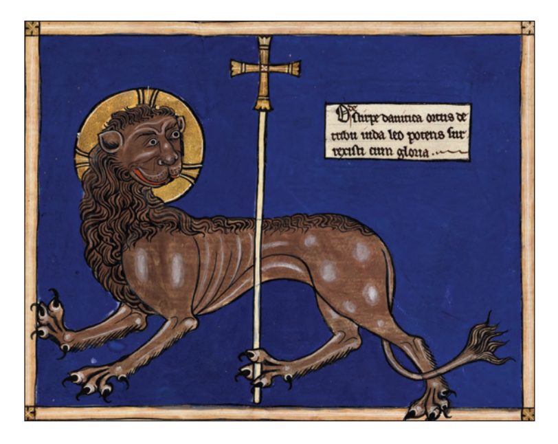
Fig. 13. Lion with cross staff. Liber floridus , 1250–70. Bibliothèque nationale de France.

There is a profound paradox regarding the image of the meek and lowly Lamb, who has now become victorious and has the power to conquer and cast out the beast. The paradox is the same as the Suffering Servant—that the victory over sin, death, and hell could only be accomplished through humility and submission to the will of the Father and self-sacrifice on behalf of others.