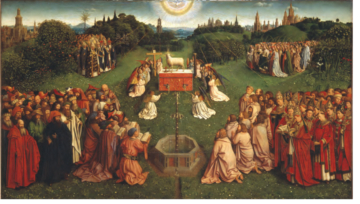
Fig. 14. Jan van Eyck, The Adoration of the Lamb , detail from the Ghent Altarpiece, 1432. Scala/Art Resource, NY. Cathedral of St. Bavo, Ghent, Belgium. This painting depicts the Lamb of God on a raised altar with the fountain of life before it surrounded by the prophets, apostles, and other followers of Christ.

the temple of it. And the city had no need of the sun, neither of the moon, to shine in it: for the glory of God did lighten it, and the Lamb is the light thereof" (Revelation 21:22–23). In this vision many of the symbols of John's Gospel find their culmination. John saw flowing forth from the throne of God and the Lamb "a pure river of water of life," which goes forth to water the tree of life and bear fruit "for the healing of the nations" (Revelation 22:1–2). The Lamb as the heavenly temple is the culmination of the doctrine of the incarnation. In his preface John described Jesus's coming to earth to take a body as "tabernacling" among us (see John 1:14)—literally pitching His tent (the same Greek word used in the Old Testament for the Tabernacle). Later Jesus refered to his body as a temple; "Destroy this temple, and in three days I will raise