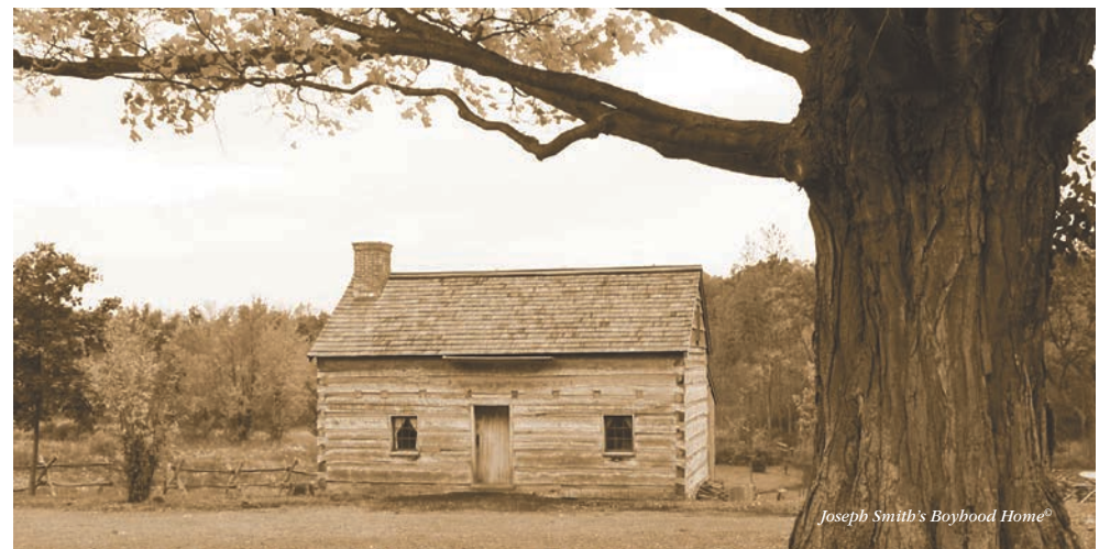
Joseph Smith's Boyhood Home ®