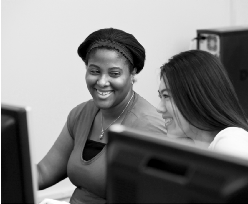
Weiden C. Andersen, © Intellectual Reserve, Inc.