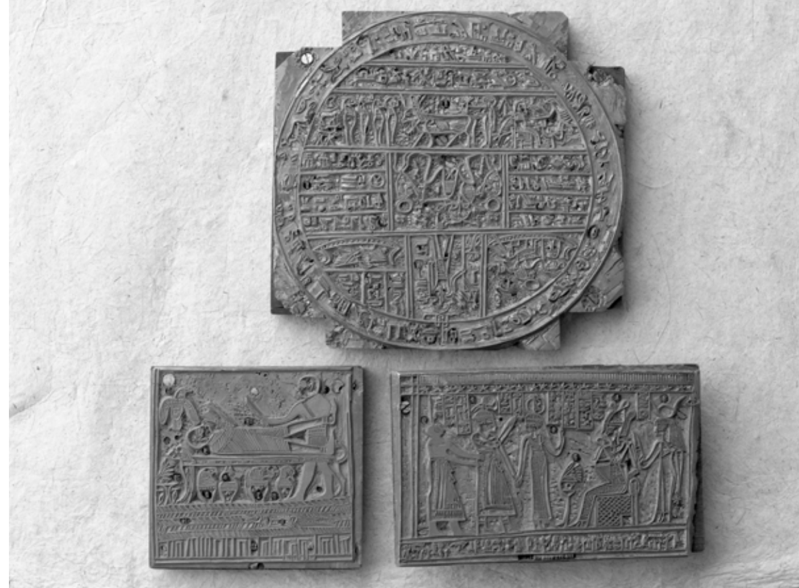
THE ORIGINAL PRINTING PLATES OF THE FACSIMILES FROM THE BOOK OF ABRAHAM, PRODUCED IN 1842 BY REUBEN HEDLOCK AND CORRESPONDING TO THE SIZE OF THE ORIGINAL PAPYRUS DOCUMENTS. WHILE FACSIMILES 1 AND 3 DERIVE FROM VIGNETTES FROM THE SAME SHORT PAPYRUS AND ARE THUS THE SAME HEIGHT, FACSIMILE 2 COMES FROM A TALLER PAPYRUS DOCUMENT.

recut with this edition and succeeding editions, becoming increasingly more inaccurate with subsequent editions.