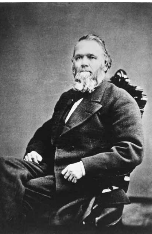
THE APOSTLE FRANKLIN D. RICHARDS PUBLISHED THE FIRST EDITION OF THE PEARL OF GREAT PRICE IN ENGLAND IN 1851 WHILE PRESIDENT OF THE EUROPEAN MISSION OF THE CHURCH.

been the standard edition ever since. The 2013 edition has only minor changes.