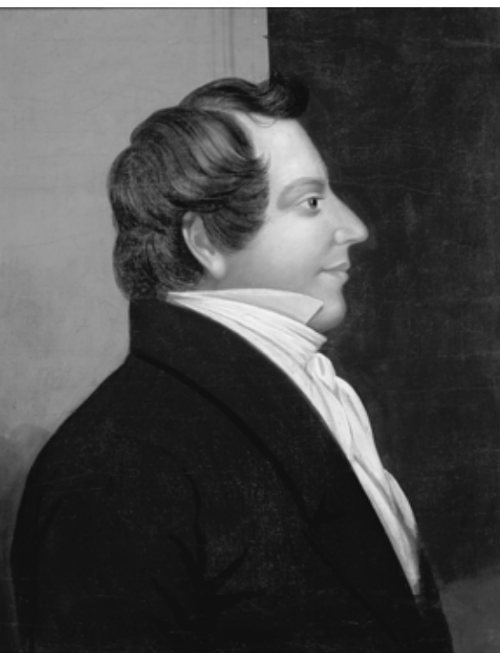
JOSEPH SMITH JR., FIRST PROPHET AND PRESIDENT OF THE CHURCH OF JESUS CHRIST OF LATTER-DAY SAINTS, WORKED ON THE BOOK OF ABRAHAM IN 1835 AND 1842.

lated by the end of July 1835; the Book of Abraham appears to have been longer than the current text. In August 1835, Joseph Smith left Kirtland to visit the Saints in Michigan, and no translation was done during the trip. Revelation pertaining to the Book of Abraham was not known to have been received again until 1 October 1835. Trans-