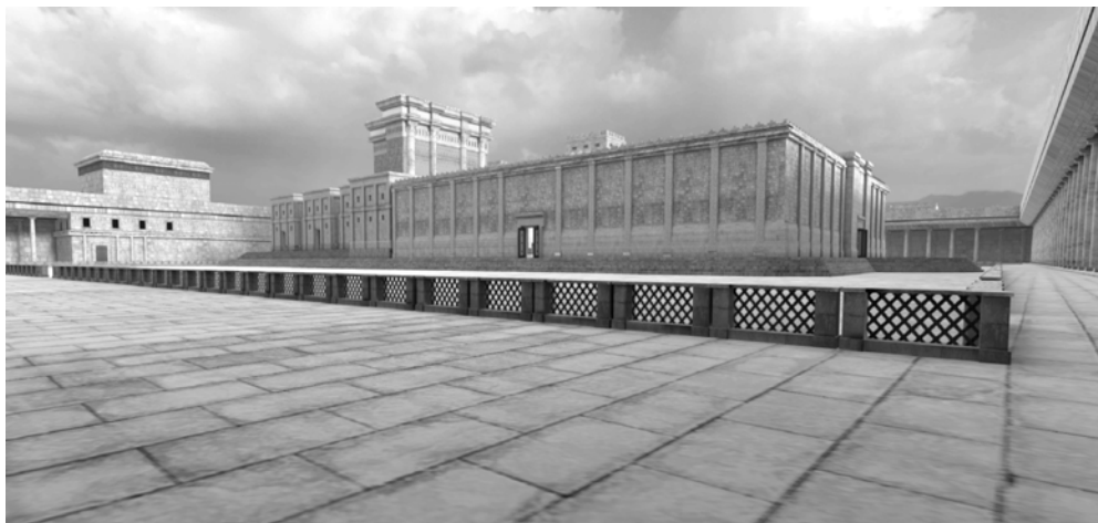
Temple of Herod looking northwest from the Court of the Gentiles.

in the north. Archaeological remains of ritual baths, or mikvahs , have been excavated near several of these gates, indicating that the Jews would ritually purify themselves before coming onto the Temple Mount. The most common entrance for pilgrims coming to the temple were the two splendid gates in the south, called the Double Gate and the Triple Gate, that were approached by a monumental stairway.