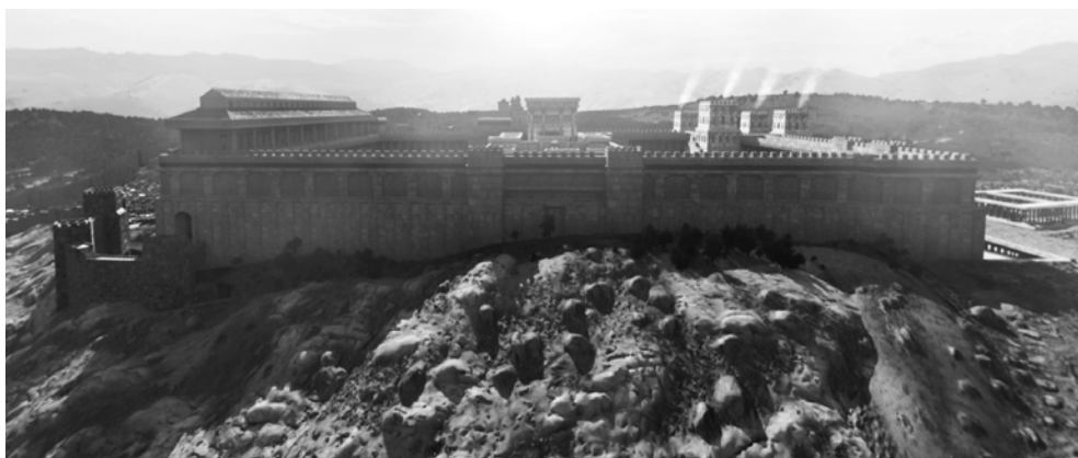
Looking West to the Temple Mount from the Mount of Olives.

From the descriptions preserved in Josephus and the Mishnah, correlated with the remains and the excavations around the Temple Mount, it is possible to reconstruct what the mount and the temple looked like with some degree of confidence. 18 The dimensions of Herod’s temple are given in cubits and/or stadia in the ancient sources; while the length of a cubit probably varied through time, most believe that the cubit used in the building of the temple was the long cubit. For the sake of convenience, this study will describe the measurements of the temple in terms of feet and meters, usually based on the long cubit of about 21 inches. 19