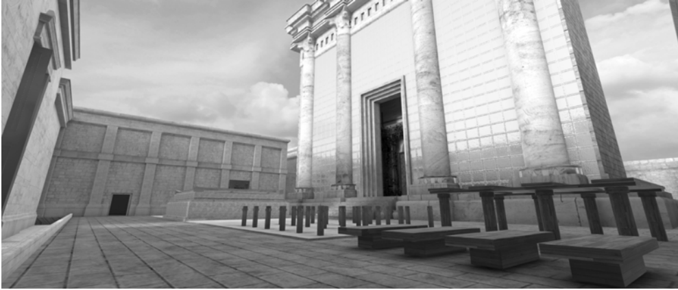
Court of the Priests.

thereon” (Middot 3:8). On the stairs leading up to the doors of the temple the priests would daily gather to recite the priestly benediction on the people (Numbers 6:23–27).