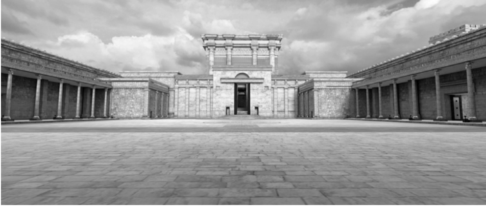
Court of the Women looking West to the Nicanor Gate, Court of the Israelites, and Court of the Priests.

the narrow Court of the Israelites separated from the Court of the Priests by a line in the pavement. Standing in the Court of the Israelites, one could see the large stone altar 40 feet [12 meters] square and 15 feet [4.5 meters] high 26 upon which the priests offered the sacrifices. A ramp led to the top of the altar that had horns at the four corners. The priests offered regular daily offerings at the temple on behalf of all Israel and also assisted in the many offerings brought by individuals to the temple. Under the law of Moses there were five major sacrifices (Leviticus 1–7). The burnt offering was the sacrifice of an animal that was completely burned on the altar—the smoke symbolized the offering ascending into heaven. In addition to the burnt offering, the sin offering and trespass offering were connected with the offering of blood for atonement from sin and ritual impurity (Leviticus 17:11). The meal offering was offered for thanksgiving. The peace offering represented a communal meal—divided into three portions: one given to the Lord, one given to the priests, and one taken home and eaten by the offerer. To the north of the altar was the Place of Slaughtering, where the sacrificial animals were butchered and skinned. Between the altar and the temple was a large bronze laver providing water for washing. Each of the priests ritually washed their hands and feet before and after officiating at the temple (Exodus 30:20–21).