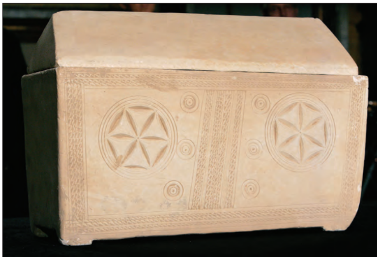
Mariamne Ossuary, found in 1981 in the Talpiot Tomb. Artistic rosettes decorate the broad side of the bone box.

“Mariam” and those of a woman named “Marah.” Through a little confusion of language, someone in the popular media confused the name Marah with the noun for “master” and thus read the inscription as “Mary a Master.” Unfortunately, the two names are written at very different times in very different writing styles, so there really is no confusion about the names. Therefore, this ossuary is unfortunately not that of Mary Magdalene, but rather of two women named Mary using slightly different spellings of that name. One would expect that if this were the tomb of Mary Magdalene that it would say that, rather than using some obscure title calling her a master. The New Testament does not ever refer to her in that way, and it is a leap of the imagination to associate any other title with Mary other than the woman from Magdala (that is, Magdalene).