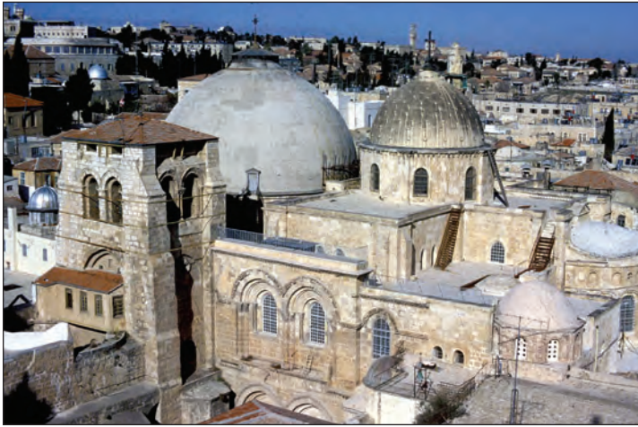
Above: Church of the Holy Sepulchre, Jerusalem.

Below: Entrance to the Holy Sepulchre, According to Christian tradition, this is the site where Jesus was crucified and buried.