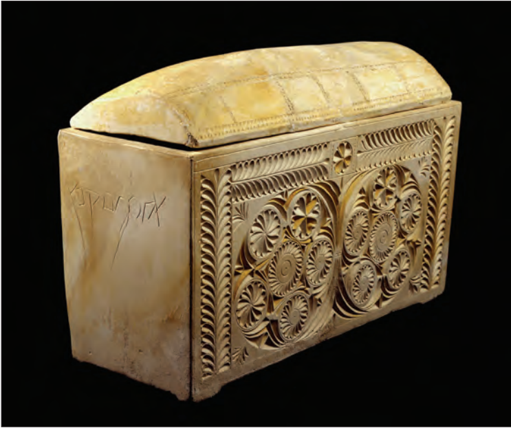
Ossuary of Caiaphas, first century AD, Israel Museum, Jerusalem, used by permission. This ossuary is believed to have held the bones of the high priest Joseph Caiaphas, whose name is still legible on the end.

of the burial locus. We conclude that Jesus was not laid in a kokh , and that He also cannot have been laid on a recessed arcosolium bench. Thus we can eliminate these features from the picture we create in our mind of what the interior of the tomb of Joseph of Arimathaea looked like. We may, however, safely conclude that Jesus was laid on a simple, unrecessed burial bench, since that is not only a prominent feature of Jewish tombs which we know archaeologically, but also is supported by the report of angels sitting at the head and foot of the burial locus after Jesus's Resurrection. This, too, gives us a fair idea of how to re-create the interior appearance of the Arimathaeans' sepulchre. And since Jesus's temporary burial