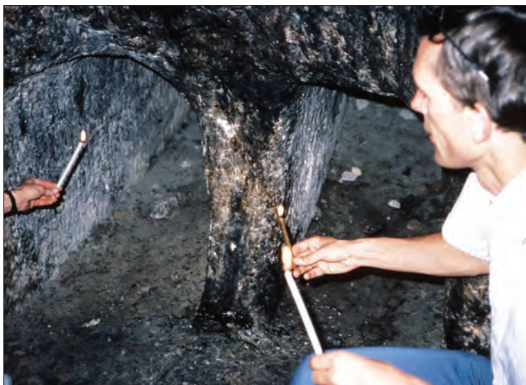
Kokhim (burial vaults) inside the Church of the Holy Sepulchre.

birth of Jesus. This means that all the tombs west of that new walled area would have been cleared, the bones redeposited in other places, and no new tombs would have been constructed at the Holy Sepulchre site during the time of Jesus's life. In other words, the Holy Sepulchre cannot be a site where Joseph of Arimathea's tomb would have been constructed.