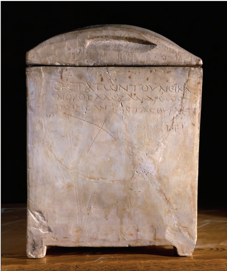
End side of the ossuary of Caiaphas, first century AD, Israel Museum, Jerusalem, used by permission. The high priest's name is scratched into the soft limestone from which the box was carved.

there was a primary interment rather than a secondary one, the question of an ossuary is not even relevant.