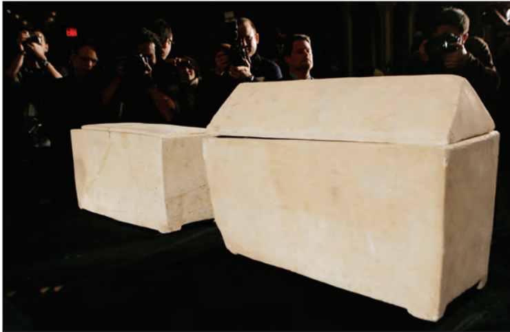
Ancient Jewish ossuaries on display at the “Jesus Family Tomb” press conference, February 26, 2007.

Christians this was an unsettling claim because the program further alleged to have found the ossuary, or bone box, that had held Jesus’s bones—a direct contradiction to the story preserved in the four Gospels that Jesus had indeed risen from the grave.