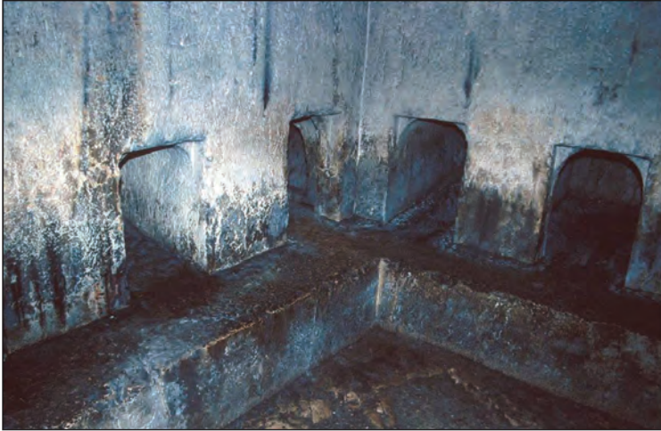
First-century AD kokhim burial vaults in Jerusalem's "Tomb of the Kings." These vaults were used for both primary and secondary burial.

was essentially a three-sided bench, with a small place in the middle floor where those who were visiting the tomb or bringing a body in could stand. Variations of this tomb style sometimes included entrance chambers where bodies were not buried, connected to one or more adjoining interior chambers where the burial benches were located. Often there were also perpendicular burial vaults carved into the wall on a long axis either at floor level or above the burial bench. These perpendicular burial vaults were called kokhim (a singular vault was called a kokh ).