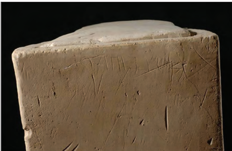
The Yeshua Ossuary from the Talpiot tomb. An explanation of the Yeshua inscription appears on the next page.

of Joseph,” more properly the name is actually Yehosef or “Jehoseph,” which has one letter more than the name “Joseph” from the New Testament. Yeshua , the name that we pronounce as “Jesus,” was a very common name in ancient Judea. So also was Yosef , or “Joseph.” There are also two other forms of the name Joseph—the short form Yosi (spelled “Jose” or “Joses” in our New Testament), and a longer form Yehosef (which would be “Jehoseph” in King James English). Sometimes both Yosef and Yehosef are expressed in English as “Joseph,” but they are actually two very distinct and different names.