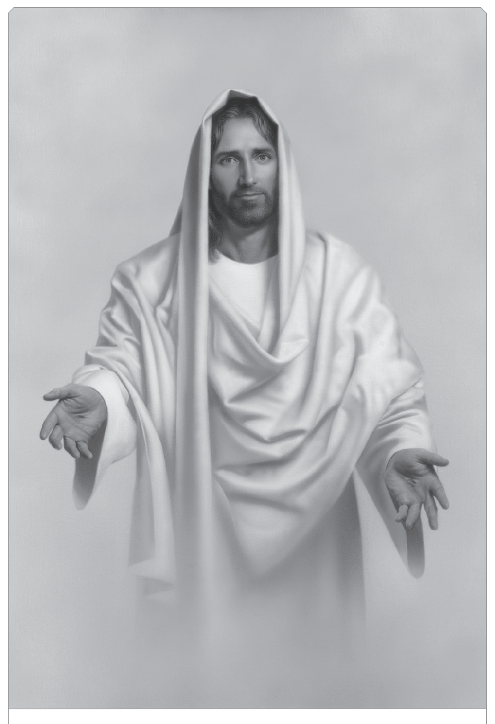
The Atonement itself is a fruit of Christ's own agency: he freely suffered and gave his life for mankind, freely submitting his own will to the will of the Father.