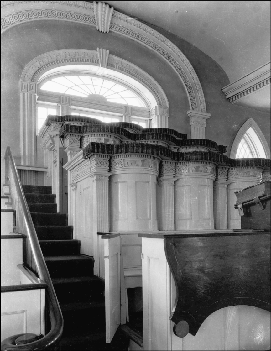
Kirtland Temple interior showing the Melchizedek Priesthood pulpits, detail of west pulpits, lower assembly room, 1935.